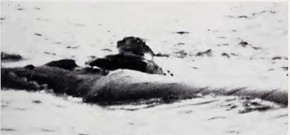
Fig. 5. A whale pushes its horizontal partner sideways with its lower jaw in contact with the dorsal surface in the vicinity of the blowhole. (Photo from ciné-sequence)

The active whale approached at an angle of 90^\circ and, with its lower jaw in contact with the dorsal surface of the passive partner, pushed it sideways (Fig. 5) or some-